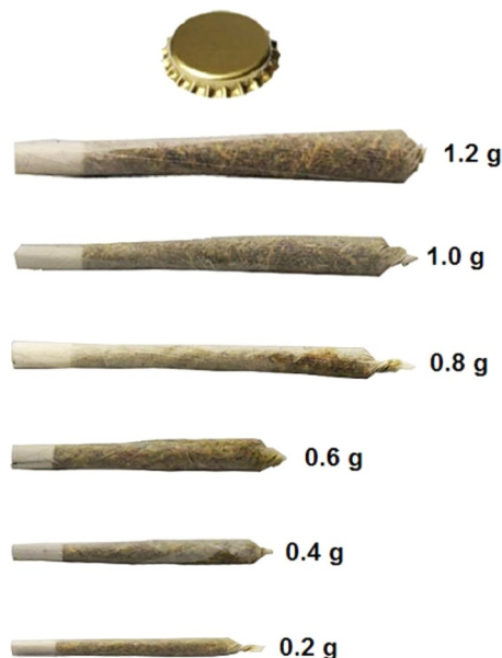
Fig. 3. Reference image for dried herb reported as number of joints.

Post-stratification sample weights were constructed based on Canadian and US Census estimates. Respondents from Canada were classified into age-by-sex-by-province and education groups. Respondents from US ‘legal’ states were classified into age-by-sex-by-legal state, education, and region-by-race groups. Those from ‘illegal’ states were classified into age-by-sex, education, and region-by-race groups. Corresponding grouped population counts and proportion estimates were obtained from Statistics Canada and the US Census Bureau (Statistics Canada, 2019a, 2019b; US Census Bureau, 2017a, 2017b). Separately for Canada, US ‘legal’ states and US ‘illegal’ states, a raking algorithm was applied to the full analytic sample ( n = 27,169 ) to compute weights that were calibrated to these groupings. Weights were