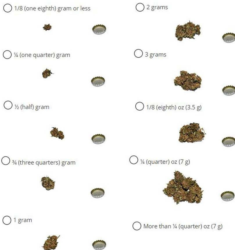
Fig. 4. (a) Reference image for dried herb reported in standard units (e.g., g, oz). (b) Reference image for dried herb amounts above 1/4 oz.