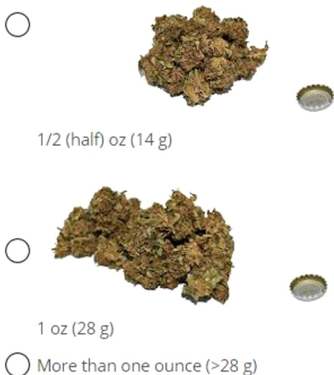
Fig. 4. (Continued)

include an indicator variable representing ‘jurisdiction’ (i.e., Canada, US ‘legal’ state, US ‘illegal’ state). Analyses at 12-, 24- and 36-month follow-ups will also include a ‘wave’ indicator variable (i.e., baseline vs. follow-up wave), which will be crossed with the jurisdiction variable. This analytical approach is similar to a ‘difference-in-difference’ approach but allows more precise modelling of differences across multiple survey waves. Models will also include a standard set of covariates (including age, sex, education, and race/ethnicity) to adjust for socio-demographic profiles across conditions and examine their association with outcomes.